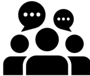
Madalo Wadatashi Beeleed