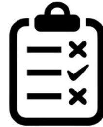
Xog-uruin Waayoaragnimo Kirayste