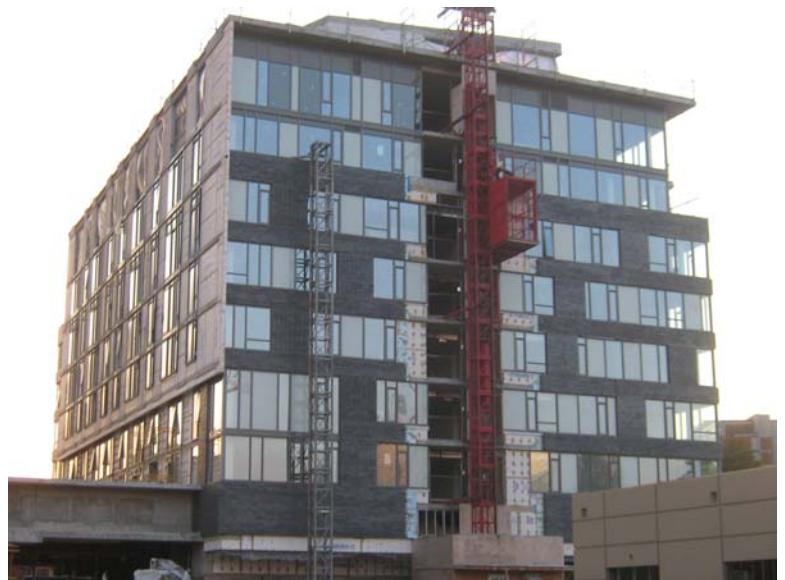
Top: Artist's drawing of 246 and 252 Sackville with 246 Sackville circled. Bottom: Construction photo of 246 Sackville taken in late-September.