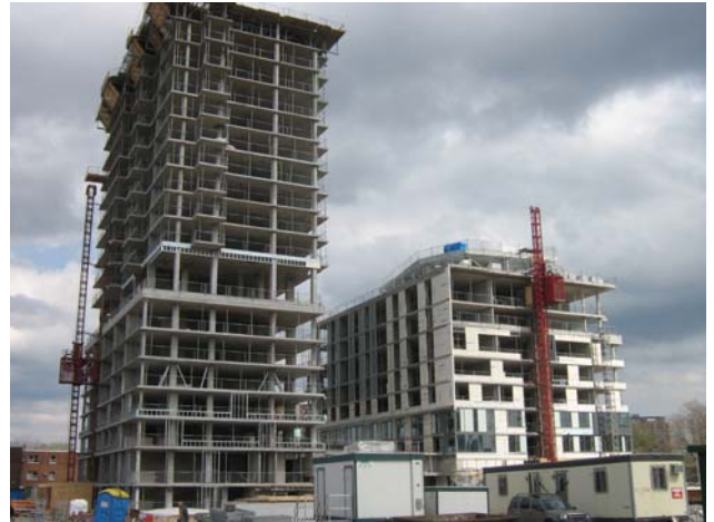
Construction on the family and seniors buildings at Dundas and Sackville continues. This photo is from May 2008.

In the fall, each household will be shown different options for Phase One return. A household will have the option to defer their choice to a later phase if they prefer.