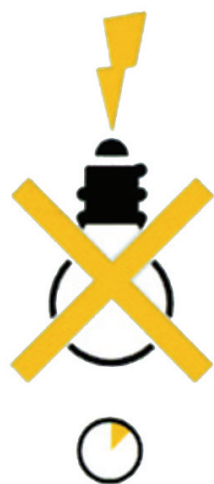
Incandescent light bulb

in energy cost - the money saved goes right back into fixing up buildings.